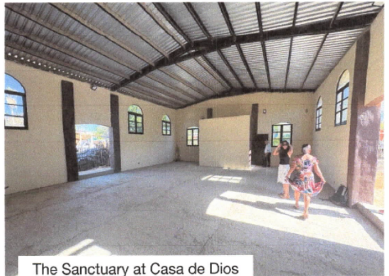
The Sanctuary at Casa de Dios needs to be completed.