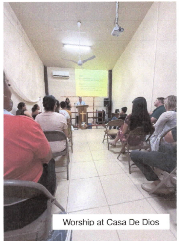
Worship at Casa De Dios