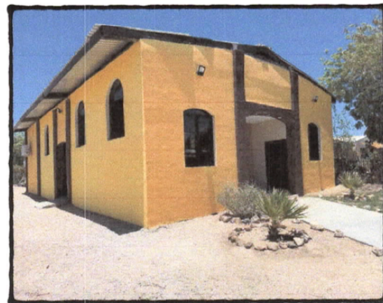
Casa De Dios, Los Planes, Mexico