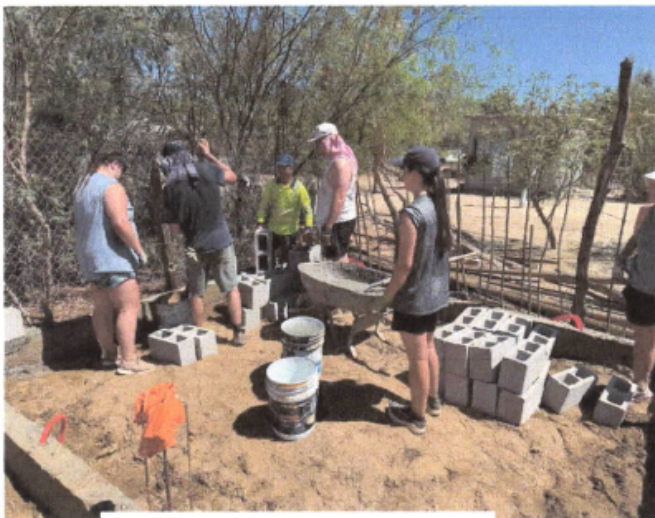
Start of the Outdoor Kitchen